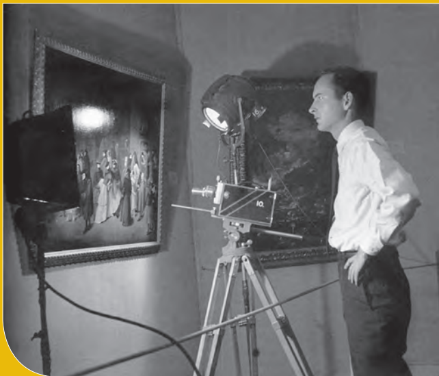
James Ivory snima sliku venecijanskog umjetnika Pietra Longhija u San Diego Art Museumu, 1957. James Ivory during filming in the San Diego Art Museum; the painting is by the Venetian artist Pietro Longhi (1957)