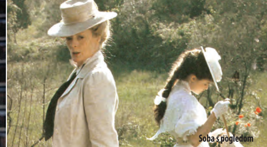
Soba s pogledom