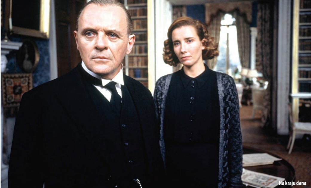
Na kraju dana