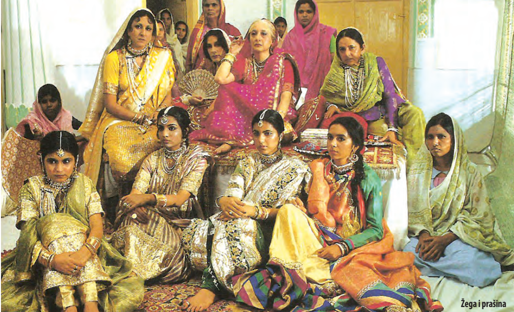
Žega i prašina