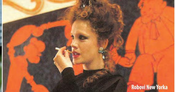
Robovi New Yorka