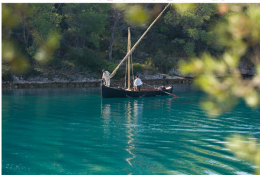
Rade Šerbedžija_Bojan Brajčić_Lučev Damjanić 01.jpg