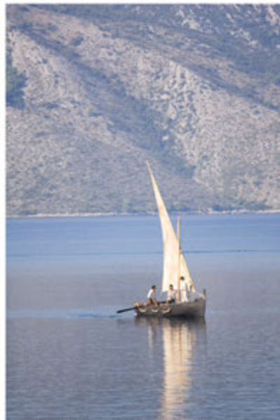
Gajeta na moru 01.jpg