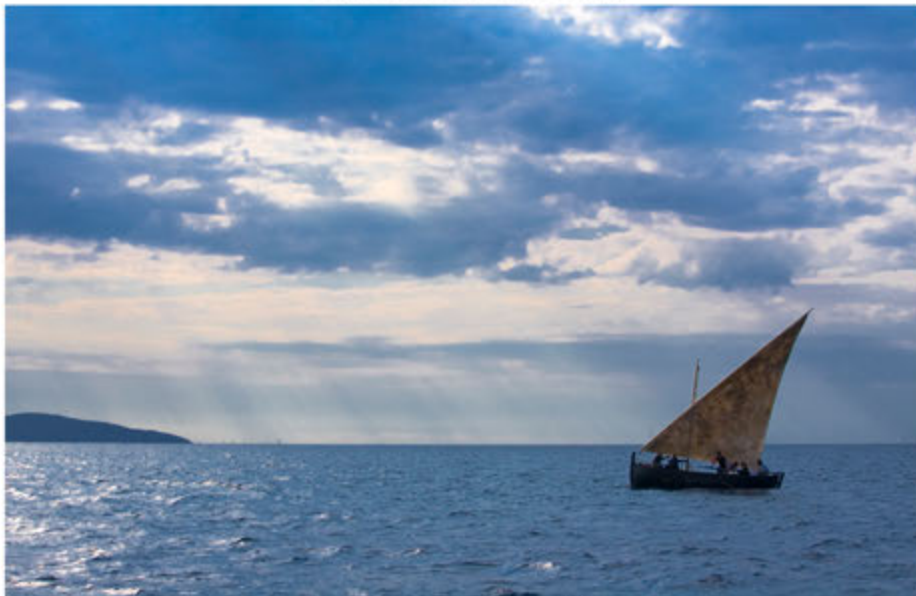
Gajeta na moru 04.jpg