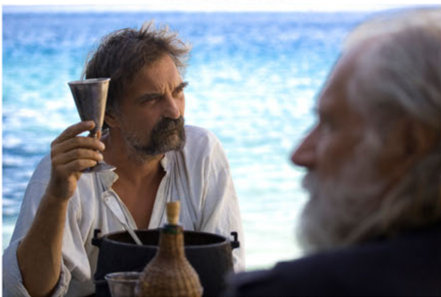
Leon Lučev_R. Šerbedžija 01.jpg