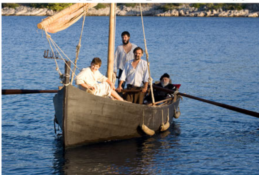
Rade Šerbedžija_Bojan Brajčić_Lučev Damjanić 06.jpg