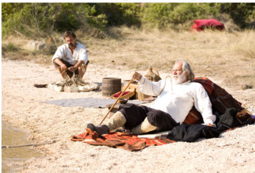
Rade Šerbedžija_Lučev 01.jpg