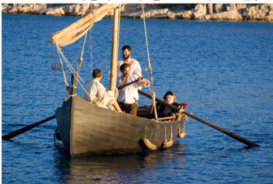
Rade Šerbedžija_Bojan Brajčić_Lučev Damjanić 07.jpg