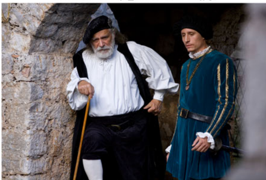
Rade Šerbedžija_Giulliano Satini.jpg