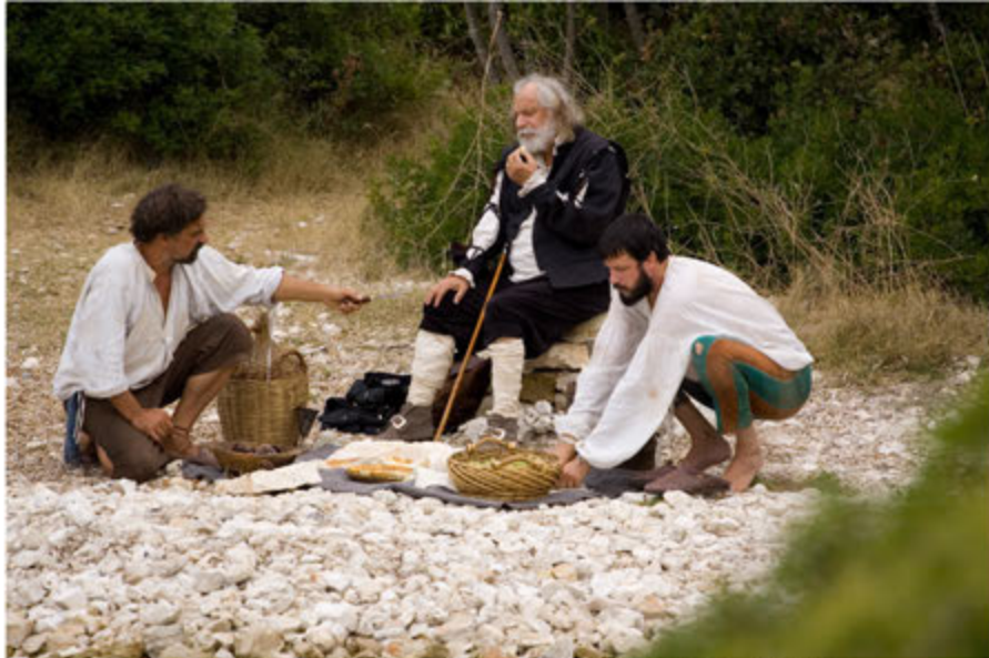
Rade Šerbedžija_Bojan Brajčić_Lučev 02.jpg