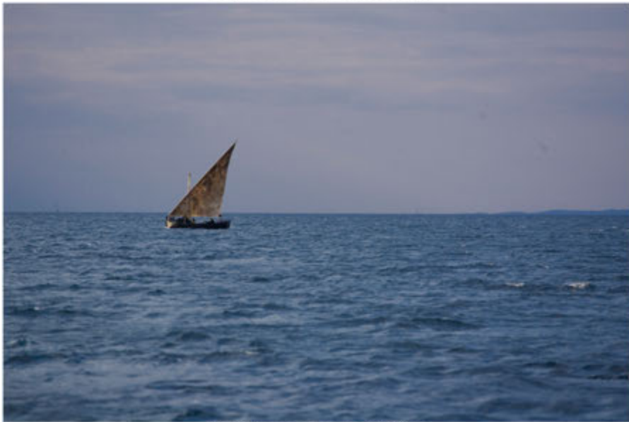
Gajeta na moru 03.jpg