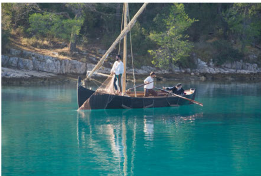
Rade Šerbedžija_Lučev_Brajčić 01.jpg