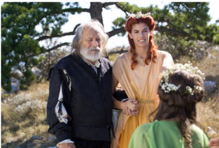
Rade Šerbedžija_Gala Nikolić 01.jpg