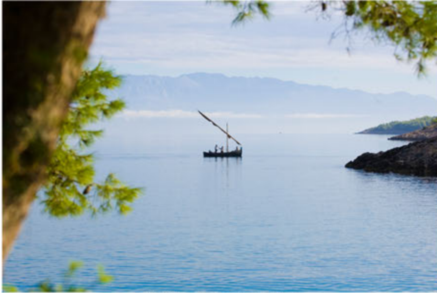
Gajeta na moru 02.jpg