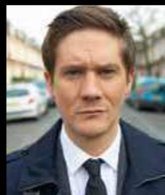
DI Mill – investigating the postcards

"You'd be surprised how little a million pounds actually covers these days" Roger – no.92